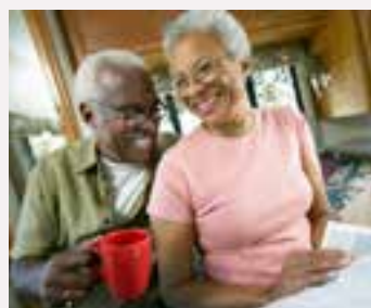
HUMOUR HUNT Amusing stories from our readers