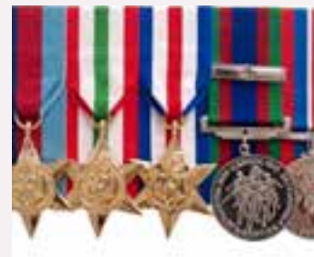
ARTIFACTS Fascinating relics from military history