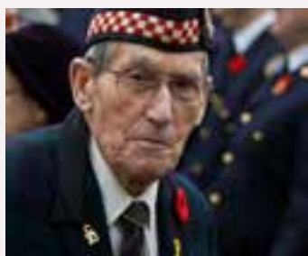
O CANADA Tales of deeds and people who shaped our country