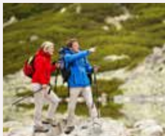
MILITARY HEALTH MATTERS Medical trends and research