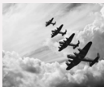
ON THIS DATE Highlights of historic events, day-by-day