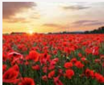
FACE TO FACE Debates over controversial questions from our history