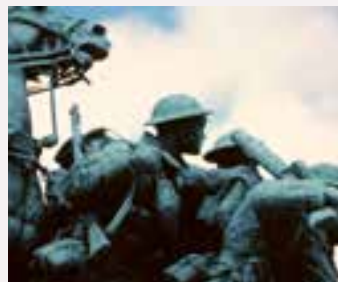
HEROES AND VILLAINS Celebrated and notorious adversaries