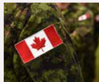
IN THE NEWS In-depth coverage of Canadian communities, veterans benefits and today's military news