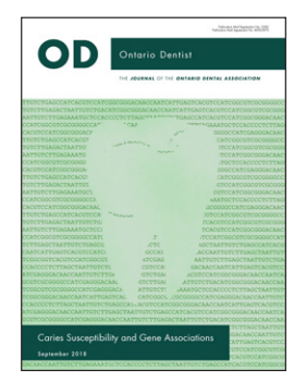
Editorial and dates subject to change.